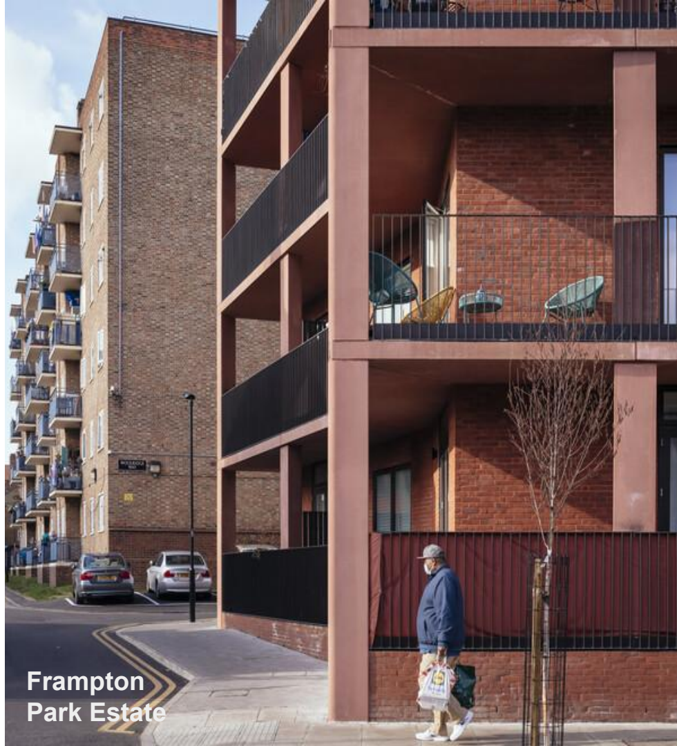
Frampton Park Estate