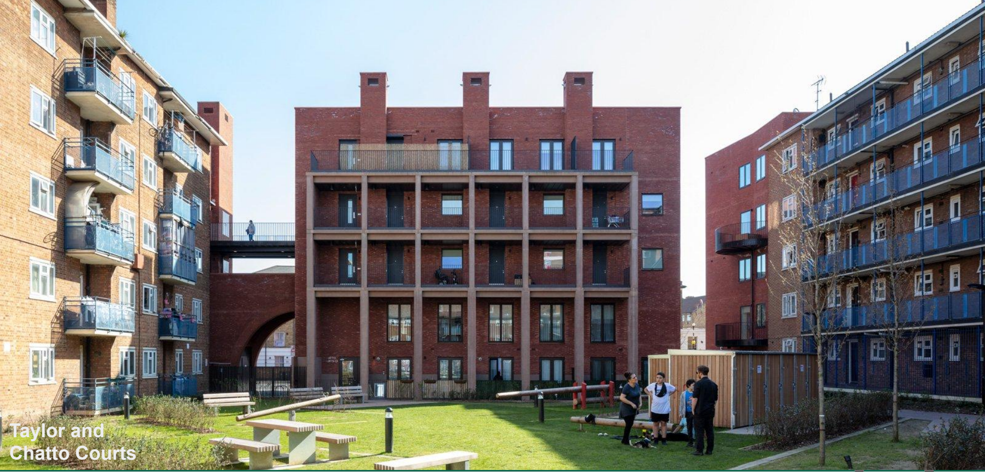
Taylor and Chatto Courts