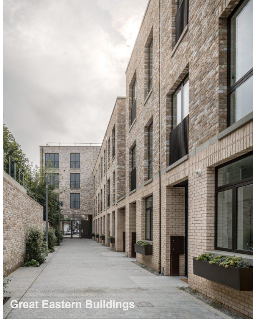
Great Eastern Buildings